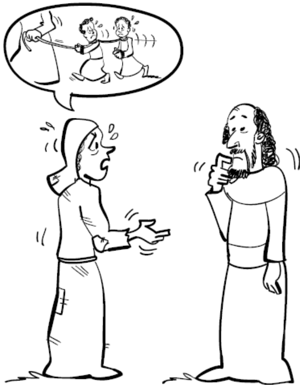
Widow explains her problem to Elisha

Point: God graciously provides what is needed to give his people a hope and a future