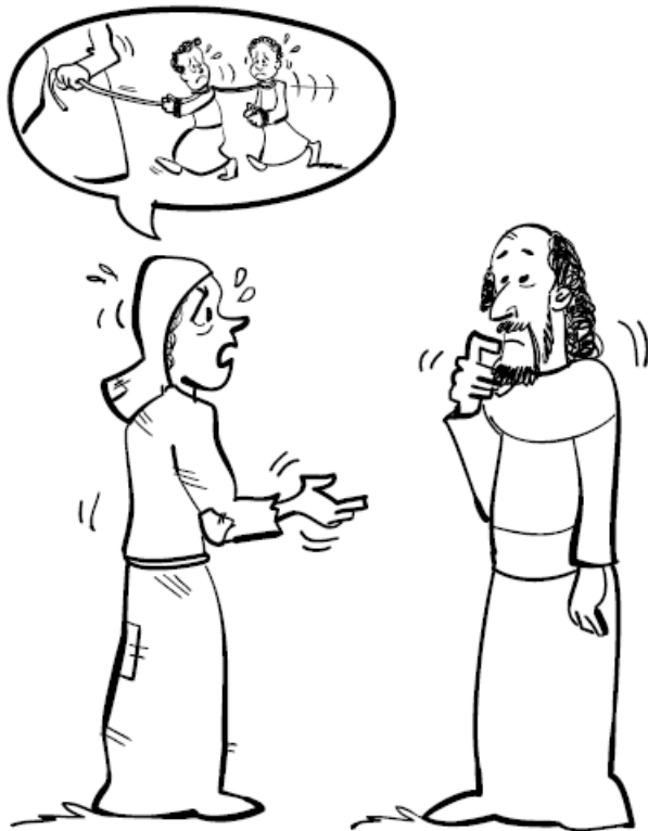
Widow explains her problem to Elisha

Point: God graciously provides what is needed to give his people a hope and a future