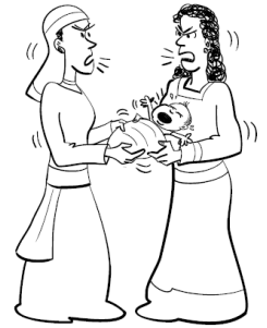
Women fighting over baby

What did Solomon ask God to give him? (3:9) _____