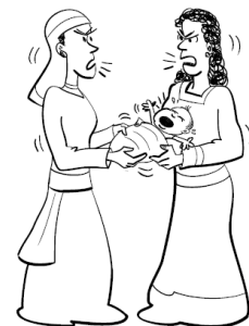
Women fighting over baby

What did Solomon ask God to give him? (3:9) _____