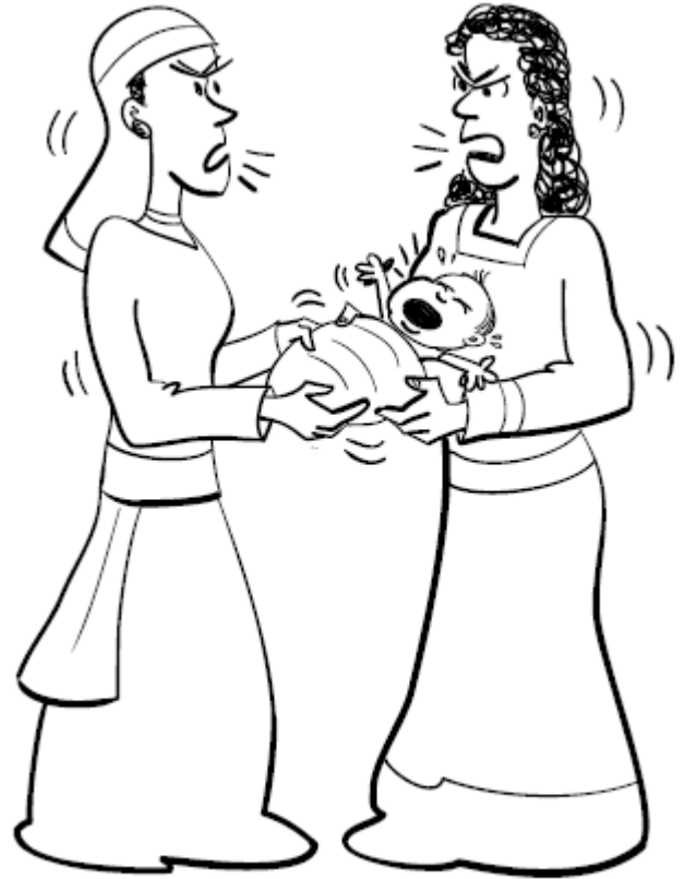
Women fighting over baby

Solomon was the third king of Israel. He became king after David. God appeared to Solomon and told him to ask for anything he wanted. Solomon asked for wisdom to rule God's people.