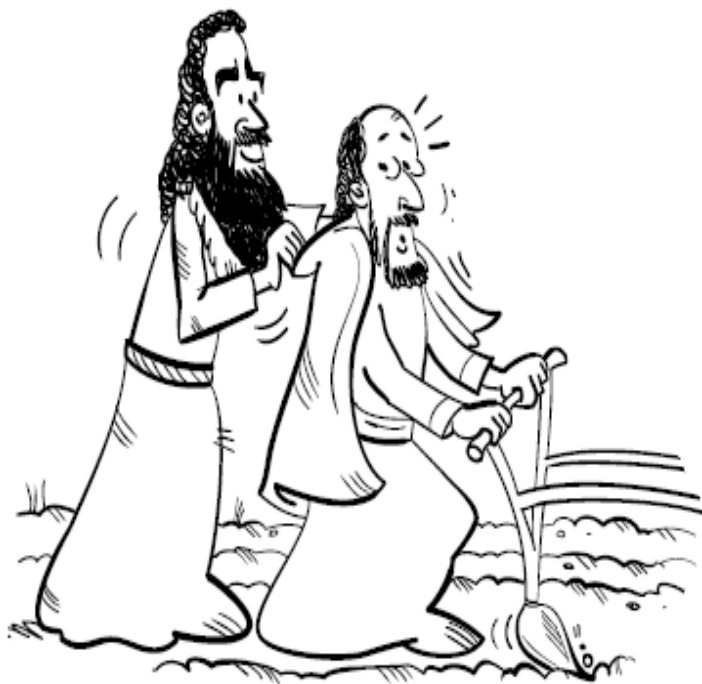
Elijah calls Elisha

Point: God's plan for his people will always continue through the leaders that he provides.