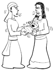
Women fighting over baby

Solomon could have asked for anything he wanted, but he understood how important it was to rule God's people well. He needed God's help to know what was right and good, and what was wrong and foolish. Solomon wanted to rule God's people in a godly way.