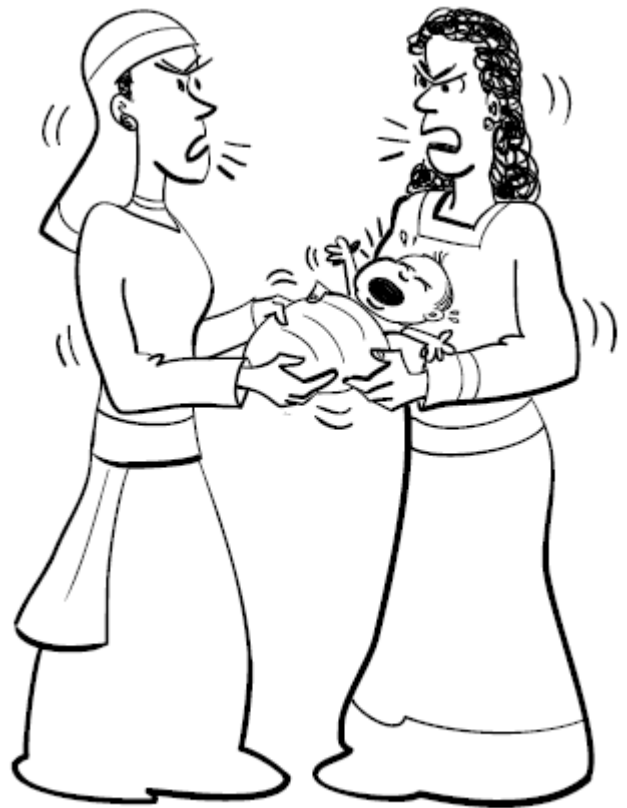
Women fighting over baby

Solomon was king David's son, and the third king of Israel. He became king after David. God appeared to Solomon and told him to ask for anything he wanted. Solomon asked for wisdom to rule God's people.